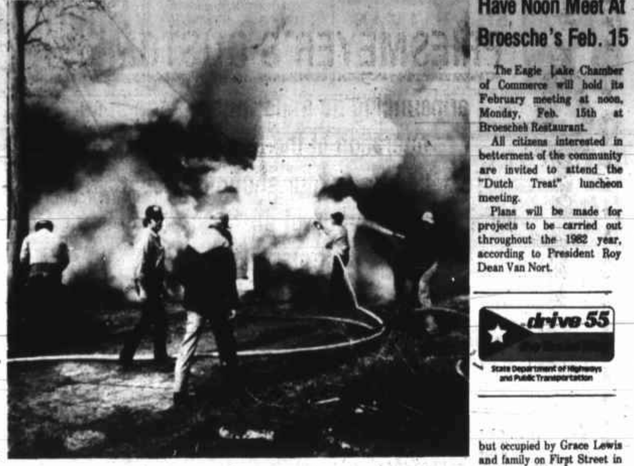
Eagle Lake volunteer firemen are shown battling a blaze which gutted a wood frame house on First Street at around 9:30 a.m. Monday.